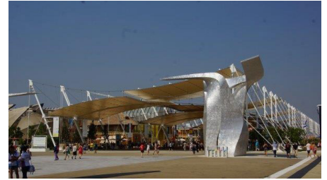
12 LIEBESKIND STATUES