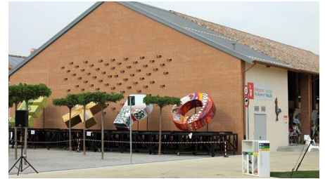
14 ONG PAVILLION