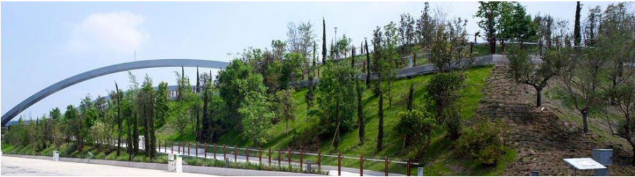
13 MEDITERRANEAN HILLS